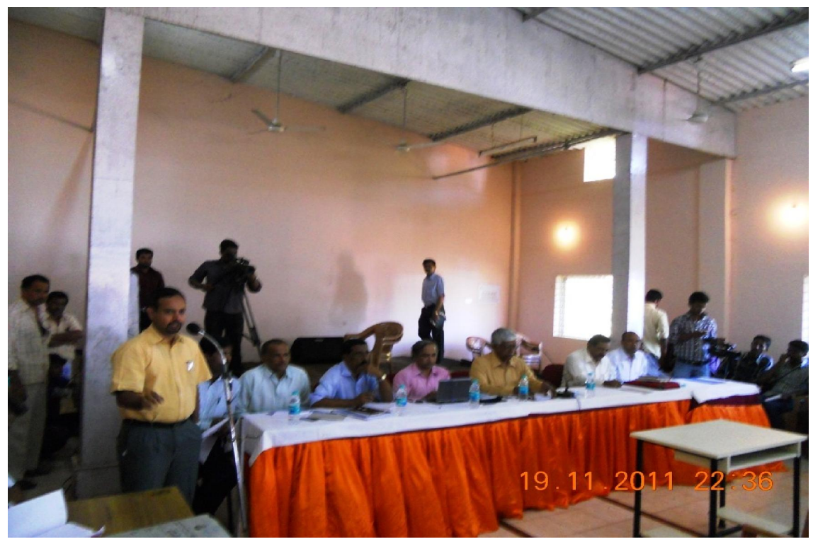
Committee Members conducting the sessions in the presence of DC