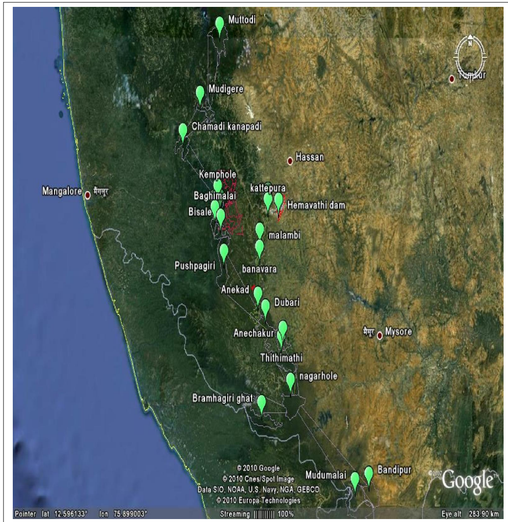
Figure 3.1: Mudumalai – Nagarhole – Brahmagiri – Muttodi Migratory Path

This migratory path extends from Mudumalai National park in Tamil Nadu upto Muttodi region in Karnataka. It includes Mudumalai National park, Bandipur National Park, Nagarhole National park, Anechakur, Thithimathi, Dubare, Somwarpet, Brahmagiri and Pushpagiri Wildlife Sanctuaries, Bisale RF, Kaginahare, Kachinkumari, Charamadi, Kemphole, Mudigere and Muttodi. The elephants move from Mudumalai national park towards Nagarhole, further via Pushpagiri WLS and Bisle RF upto Muttodi. This migratory path is composed of diverse vegetation types ranging from wet evergreen forests to semi-evergreen forests, moist deciduous forests, swamps, riverine vegetation, shola forests and grasslands. Such rich and diverse pattern of vegetation provides ample resources for elephants moving on this route.