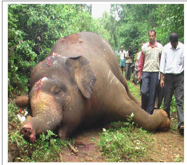
Figure 3.3: Elephant death due to HT (Shettihalli, Hongadhalla Panchayat)

Lot of elephant deaths are also caused by the high tension electric wires (Figure 3.3). The construction of hydroelectric projects also involves laying down of long electric wires. Sometimes the elephants accidentally come into contact with such wires and get electrocuted resulting into their death.