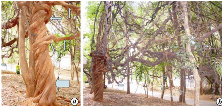
Figure 1. The tree-form of Entada pursaetha . a , Self-supporting trunk (thick arrow) in proximity to Bauhinia purpurea (Leguminosae). The pleats comprising upright trunk uncoil at or above breast height (thin arrow) and diverge as separate branches (thin arrows) that lean on the surrounding support trees. b , Festoons of secondary branches suspended from support trees. Entada has overtaken and oversized B. purpurea .