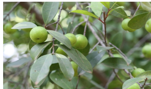
Garcinia indica (Thouars) Choisy (Fruiting)