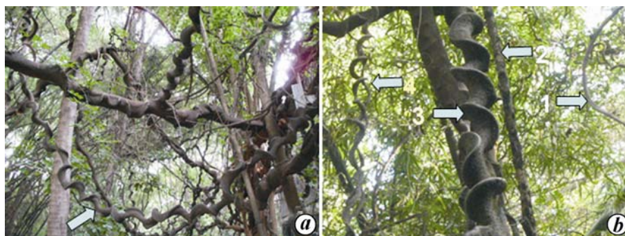
Figure 2. The climber-form of E. pursaetha . a , Hammock-like branches with twists (arrow). b , Major types (arrows) of branches, numbered 1 to 4. Note Archimedes screw patterning in branch # 3.