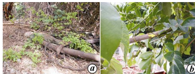
Figure 6. Regeneration in E. pursaetha . a , Sprouting of shoots in cut, aerial stolons and attached branch. b , Forked leaf tendrils showing anticlockwise twining.

Aerial stolons (diameter approximately <10 cm) that had begun to cause obstruction to vehicular traffic were cut. Two to four metre long cut pieces of woody stems (diameter 20–30 cm) were gathered and left in the open. In about 4 weeks the cut stems sprouted one to 1½ m tall shoots with stiff, erect stems producing foliage (Figure 6). Since sprouting occurred during the dry season, this observation signifies that Entada stores considerable water inside the stem tissue. However, the cut stems did not root, and the sprouts dried after the rains ceased. However, the ability of cut stems to resprout has implication in its natural habitat where strong wind and rain prevail: The branches that are unable to resist wind-induced breakage or those that are unstable under their own weight may fall on the ground and function as ramets (vegetatively produced, independent plants). This raises the question of the specific contribution of the ramets (broken and fallen branches that resprout and form roots) versus the genets (single individual plants from sexually formed seeds) in the composition of Entada thickets in its natural habitat. In Panama, Putz 20 noted the propensity for lianas to sprout vigorously from fallen stems. Based