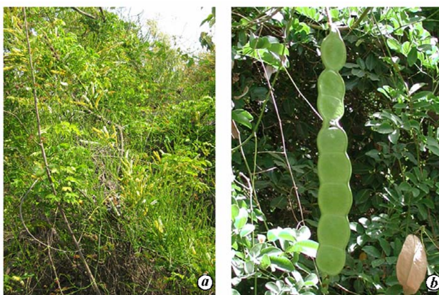
Figure 3. a , Entada in a decumbent orientation against a wall is distinguished from other species of woody climbers by white and yellow inflorescence. b , A 2 ft long pod.

Some of its overhanging leafy branches that were exposed to full sunlight during March–April (before monsoon rains begin) produced inflorescence (Figure 3).