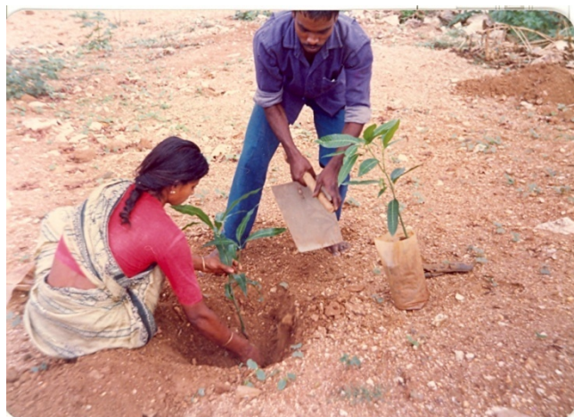
Figure 1: Picture showing the type of terrain on which the miniforest was raised

to the CES in the campus of Indian Institute of Science was chosen for planting tree saplings from the forests of the Western Ghats that came to be known as the miniforest. Saplings (480 no's.) belonging to forty nine species (Table 1) which were raised at the CES Field Station Nursery at Sirsi, Uttara Kannada district were obtained and planted along with few species already existing on the plot with a spacing of 3 x 3 m.