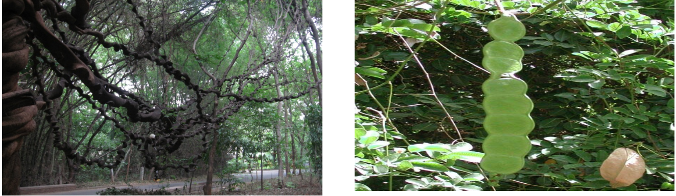
Figure 3: A gigantic liana Entada rheedii Spreng.(with fruits)

at about 3 to 3.5 m below the ground. This indicates that land cover dynamics play a decisive role in recharging the groundwater sources. Four families of Slender Loris ( Loris tardigradus ) inhabiting here is an