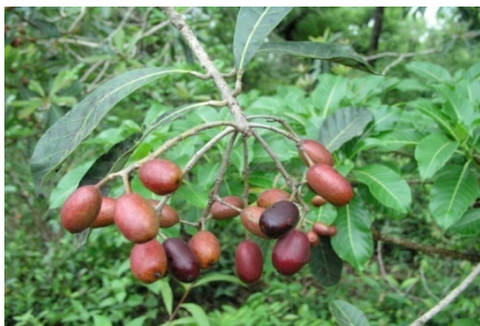
Holigarna arnottiana Hook. f. (Fruiting)