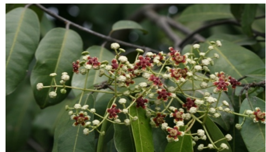
Lophopetalum wightianum Arn