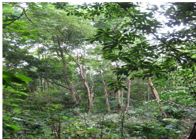
Figure 2: A view of Miniforest

It is observed that in less than 25 years, the experimental plot, now termed 'Miniforest' on account of the limited area, is transformed into a lush green forest on a terrain that was originally a scrub vegetation of the Deccan plateau type with apparently conditions alien to most of the species that have been introduced. The miniforest, in this respect, presented an opportunity to study the adaptations and succession of the Western Ghats forest species (Table 1) in comparison with native species existing in the area. The species composition that emerged in the experimental plot is quite interesting. Majority of them are the Western Ghats species whereas the others, the native to scrub vegetation, both found growing in perfect harmony, in spite of the difference in rainfall (850 mm), humidity, temperature and soil conditions for the former species (Fig 2). The miniforest trees exhibited normal robust growth, flowered and set fruit as they would do in their native habitat. Some of the trees, for example Mitragyna parvifolia (Roxb.) Korth., Chukrasia tabularis A. Juss., Duabanga grandiflora (Roxb. ex DC.) Walp., Garcinia indica (Thouars) Choisy, Holigarna grahamii (Wight) Kurz, Lophopetalum wightianum Arn. and Syzygium laetum (Buch.-Ham.) Gandhi (Plate 1) have grown as well as they would do in the evergreen forests.