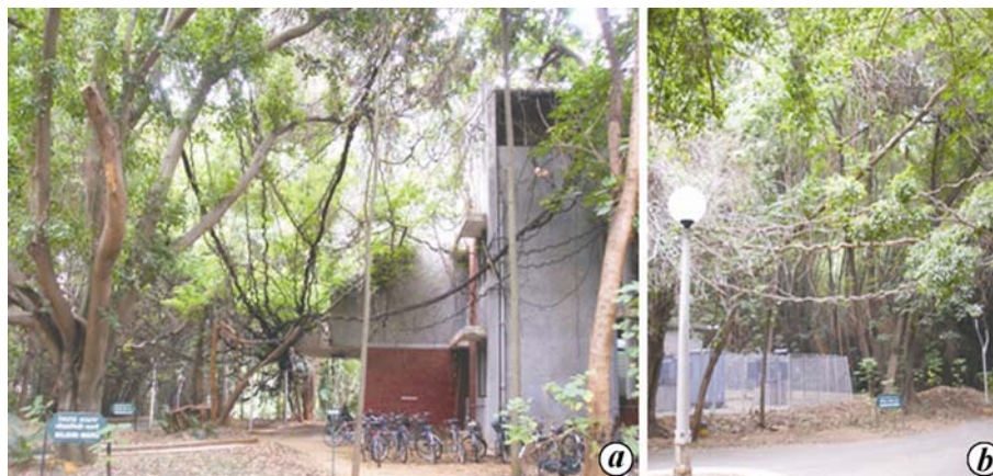
Figure 4. Mode of spread in E. pursaetha . a. Leafless aerial shoots navigating across a gap towards tree canopy. b. Horizontally extending shoots traversing a gap between trees and bypassing an inanimate support (lamp post) in a road junction in their trajectory towards living trees. Since this photograph was taken, the aerial stolons (cable-like stems) have been cut as these were posing a hazard to vehicular traffic.