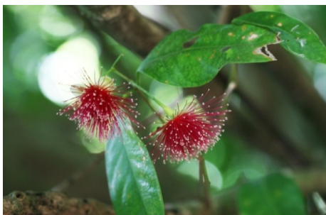
Syzygium laetum (Buch.-Ham.) Gandhi