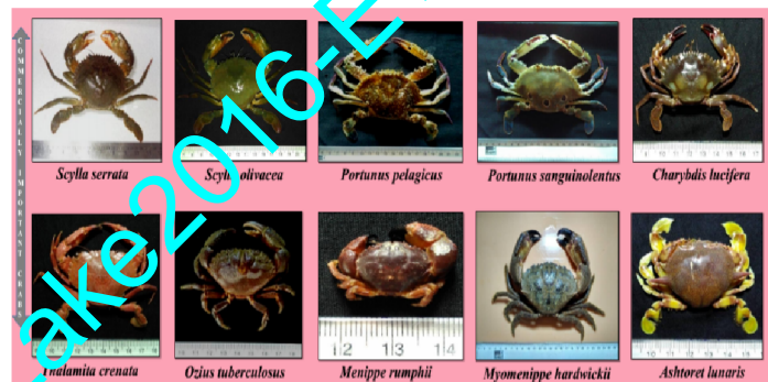
Fig. 3: Commercially important crabs of Aghanashini estuary