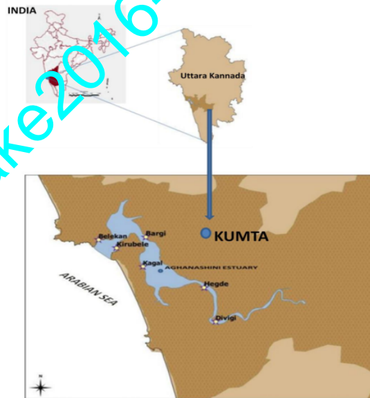
Table 1. Station-wise characterization of crab habitats studied