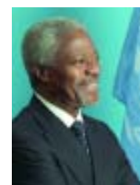
Kofi Annan, Secretary General, United Nations

The United Nations International Strategy for Disaster Reduction (UN/ISDR) aims at building disaster resilient communities by promoting increased awareness of the importance of disaster reduction as an integral component of sustainable development, with the goal of reducing human, social, economic and environmental