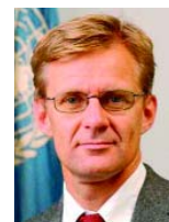
Jan Egeland, Under Secretary General for Humanitarian Affairs and Emergency Relief Coordinator, United Nations

“Disaster reduction is a responsibility of all of us. Let us reaffirm our commitment to the International Strategy for Disaster Reduction, and let us bring even more resources – political, technical and financial – to this vital cause. Together, we can protect lives and livelihoods today, and build disaster-resilient communities for tomorrow. In that spirit of partnership, I recommend Know Risk to a global audience.”