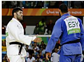
A Handshake Refusal Brought Mideast Tensions to the Rio Olympics Newser