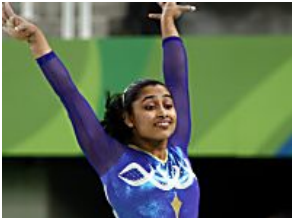
Dipa Karmakar Was Inconsolable After Returning To Games Village, Says Coach Huffington Post India