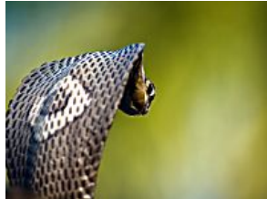
Texas Teen Committed Suicide by Cobra Newser