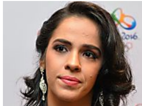
When A 'Fan' Trolled Her, Saina Nehwal Burned Him Back In The Sweetest Way Possible Huffington Post India