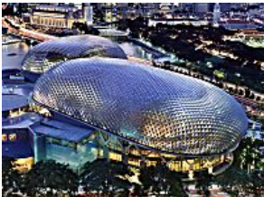
The Most Unique Buildings in all of Singapore Singapore Tourism Board