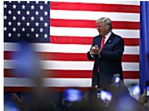
'A sense of panic is rising' among Republicans over Trump, including talk of what to do if he quits Chicago Tribune