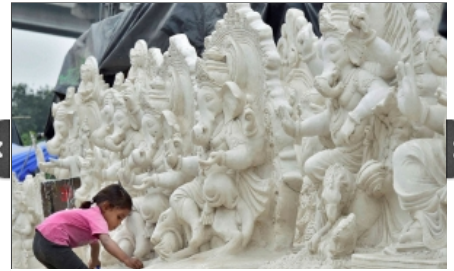
A child plays in front of idols of Lord Ganesha ahead of Ganesh festival ... more