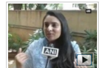
Actor-politician Ramya sticks to her "Pakistan is..."

Subscribe - Deccan Herald's YouTube channel