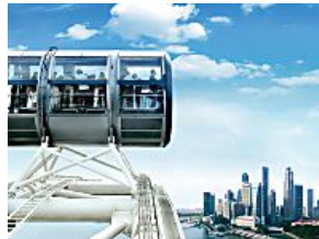
Visiting Singapore from India? 10 Things You Have to Do Singapore Tourism Board