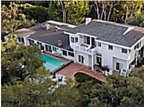
Want to See How Celebrities Really Live? See Inside These Homes That Are Currently on the Market Mansion Global by Dow Jones