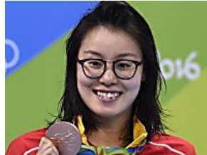
Chinese Swimmer Gives Zero F**ks About Being On Her Period At Rio Huffington Post India