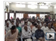
Citizens For Change: Mahalakshmpuram