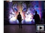
Treat for connoisseurs at Art Bengaluru