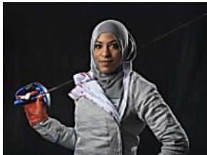
Muslim American fencer to Donald Trump: 'I don't have another home' Chicago Tribune