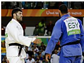
A Handshake Refusal Brought Mideast Tensions to the Rio Olympics Newser