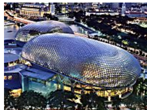
The Most Unique Buildings in all of Singapore Singapore Tourism Board