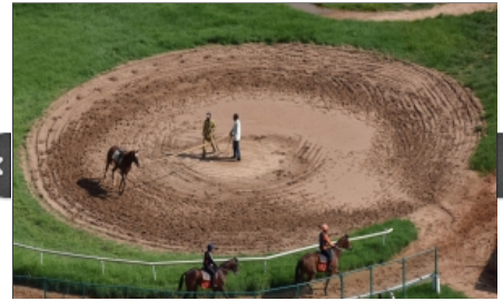
Horses undergoing exercise and training by handlers at Race Course in Bengaluru more