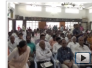
Citizens For Change: Mahalakshampuram