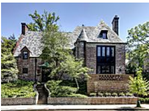
Here's the House Obama Will Live in After He Moves Out of the White House Mansion Global