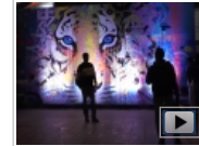
Treat for connoisseurs at Art Bengaluru