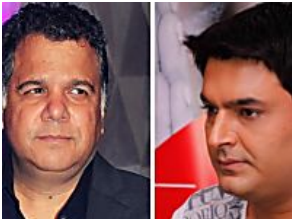
This Is The Real Reason 'Comedy Nights With Kapil' Was Pulled Off Air Huffington Post India