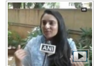
Actor-politician Ramya sticks to her "Pakistan is..."

Subscribe - Deccan Herald's YouTube channel