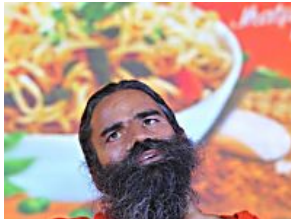
Christians Are Upset With Baba Ramdev For Misusing The Cross In Patanjali Ad Huffington Post India