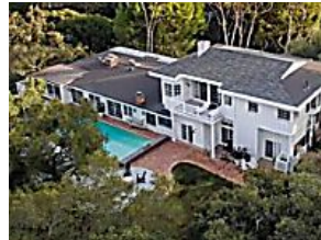
Want to See How Celebrities Really Live? See Inside These Homes That Are Currently on the Market Mansion Global by Dow Jones