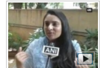
Actor-politician Ramya sticks to her "Pakistan is..."

Subscribe - Deccan Herald's YouTube channel