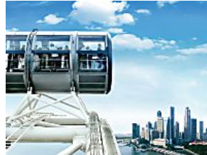
Visiting Singapore from India? 10 Things You Have to Do Singapore Tourism Board