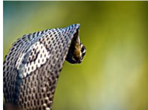
Texas Teen Committed Suicide by Cobra Newser