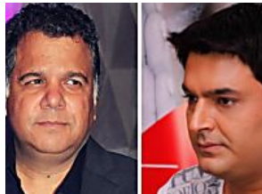
This Is The Real Reason 'Comedy Nights With Kapil' Was Pulled Off Air Huffington Post India