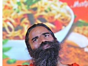
Christians Are Upset With Baba Ramdev For Misusing The Cross In Patanjali Ad Huffington Post India