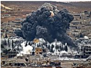
Russian Soldier Reportedly Calls In Airstrike on Himself Newser