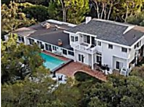
Want to See How Celebrities Really Live? See Inside These Homes That Are Currently on the Market Mansion Global by Dow Jones