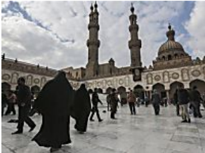
Another Islamic Movement Is Growing in Middle East Newser