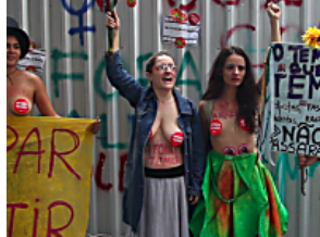
Welcome To The Anti-Olympics, Where Brazil's Artists Are Taking On Their Government Huffington Post India