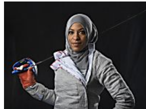
Muslim American fencer to Donald Trump: 'I don't have another home' Chicago Tribune