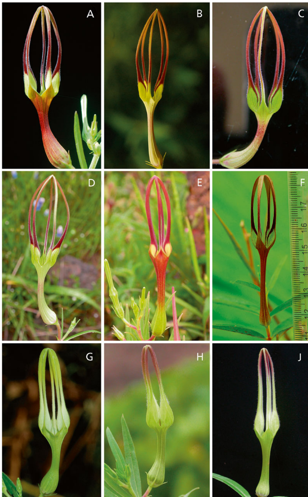
Fig. 3. Range of variation in the corolla of Ceropogia attenuata from various populations. A & C Kumta, Karnataka; B Goa; D Sulgeri, Karnataka; E & F Chiplun and Devgad, Maharashtra; G & H Ratnagiri, Maharashtra; J Mumbai, Maharashtra.