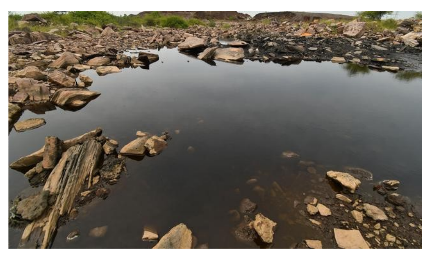
Photo used for representation purpose only.