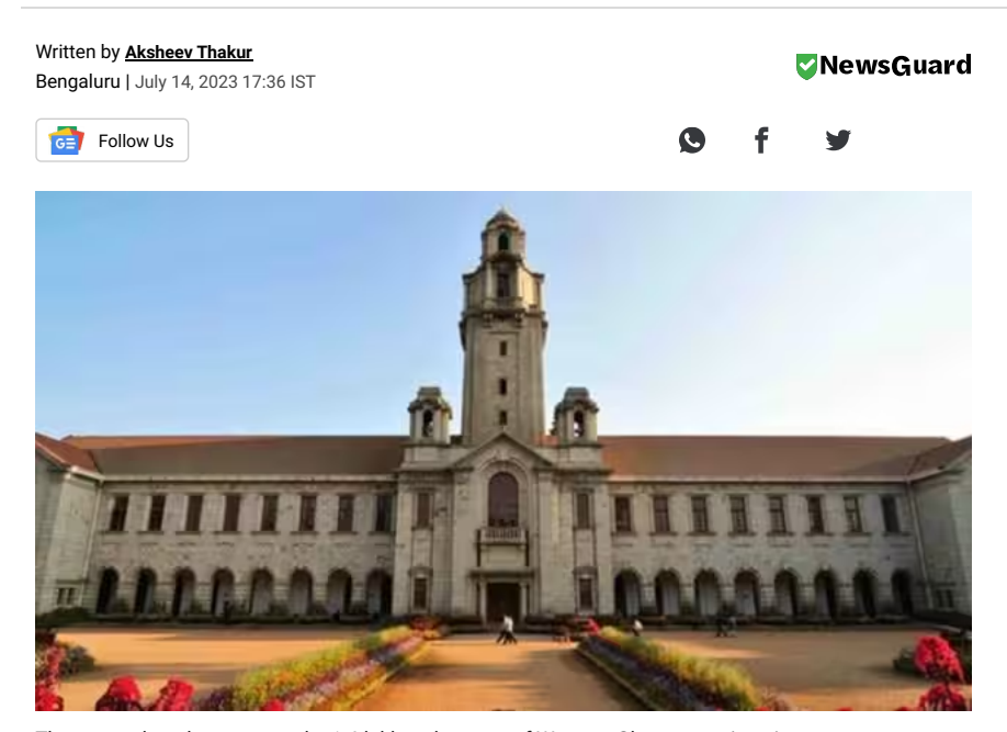
The researchers have mapped a 1.6 lakh sq km area of Western Ghats spanning six states --Maharashtra, Karnataka, Goa, Kerala, Gujarat, and Tamil Nadu -- for the portal.

The Western Ghats region, according to the researchers, witnessed large-scale land cover changes during the past century due to unplanned developmental activities with industrialisation and globalisation.