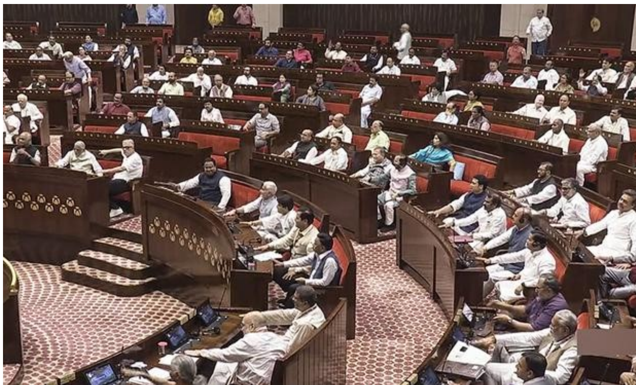
Rajya Sabha members vote on the women's reservation bill.

Last week, Parliament passed the women's reservation Bill , which provides one-third reservation for women in the Lok Sabha and Legislative Assemblies. Data from the Inter-Parliamentary Union show that the share of women in Parliament in India is around 15%. India ranks 141 out of 193 countries on this count. Even Pakistan, South Africa, and Kenya have a higher share of women representatives. Over the last 27 years, there have been several efforts to introduce the women's reservation Bill in Parliament. Such efforts faced opposition from different quarters. That there is a strong moral imperative to increase women's representation is beyond debate. The smooth passage of this law shows consensus around this issue.