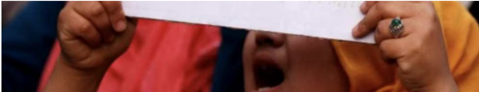
Students protest against incidents of rape (Representational Image)

New Delhi: A report by the Parliament Standing Committee on Home Affairs on atrocities and crimes against women and children has highlighted the poor conviction rates and high pendency of cases related to crimes belonging to Scheduled Castes and Scheduled Tribes.