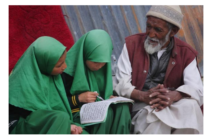
It means that there are hundreds of millions of illiterates in the OIC countries, mostly female, according to a report prepared by the OIC.

Jeddah: Illiteracy is stunningly rampant in the Muslim world. Nearly 40 percent - with varying percentages in the member states of the Organization of Islamic Cooperation (OIC), of the Muslim world's population cannot read or write.