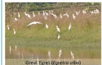
Great Egret ( Egretta alba )

This habitat has Storks, Egrets, Cormorants, Darters, Herons, Ibis, Ducks and Teals. They feed on fishes, crabs, reptiles, molluscs, seeds, etc.