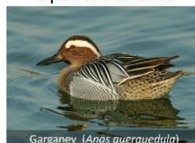
Garganey ( Anas querquedula )

Open water birds are ducks, grubs, coots, terns and gulls; most are migratory winter visitors. They have broader beaks for scooping, grasping, straining and filtering. Webbed feet help them in swimming. Gulls and Terns with strong beaks feed on crustaceans, fishes, molluscs, crabs.