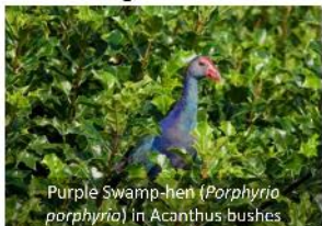
Purple Swamp-hen ( Porphyrio porphyrio ) in Acanthus bushes

Mangroves are rich in food like crustaceans, crabs, fish, bivalves, polychaete worms. Birds visit mangroves for feeding, roosting, nesting and breeding. Mangrove birds include Herons, Storks, Raptors, Owls, etc. Wintering waders feed in mudflats and roost in mangroves.