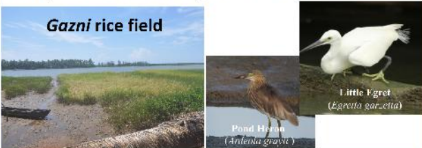
Little Egret ( Egretta garzetta )