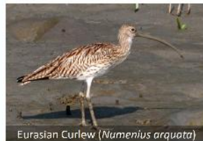
Eurasian Curlew ( Numenius arquata )

Mudflats are intertidal areas very rich in food such as soft shellfish, polychaete worms, small crabs, small fish, etc. for birds like Sandpipers, Plovers, Curlew, Terns, Gulls, etc. Their beaks are long and straight or curved to probe in mudflats for small animals, especially good for taking out preys from vertical holes. Many have thin long legs suitable for walking in mud and shallow water.