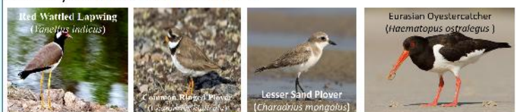
Red Wattled Lapwing ( Vanellus indicus )

Oyster-bed birds: Oyster beds occur more towards river mouth of Aghanashini. The members of Haematopus (winter visitors) with their long, strong bills can smash oyster shells and other shell fish.