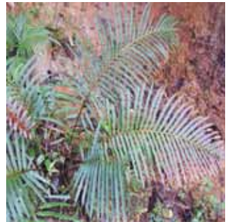
Fig. Some Ferns and Fern-allies of Western Ghats