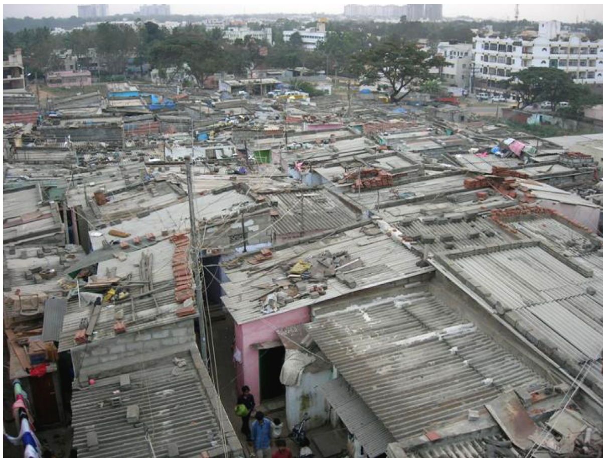
Figure 6 The plight of urban poor in Jayanagar 9th Block.

defence, and biotechnology based industries. In addition, numerous services, trade and banking activities mark the city's economic landscape. An important feature of the economic activities of Bangalore is the huge concentration of Small and Medium Enterprises (SMEs) in diversified sectors across the city. Bangalore has more than 20 industrial estates/areas comprising large, medium and small enterprises. Of these, Peenya Industrial Estate located in the northern part of the city comprises about 4000 SMEs and is considered the largest industrial estate in South and South East Asia (PIA, 2003). A majority of the SMEs function as ancillaries/subcontractors to large enterprises in the field of engineering and electronics industries, among others. The industrial estates sprung up mostly in the periphery of the erstwhile city and gradually as the city grew became