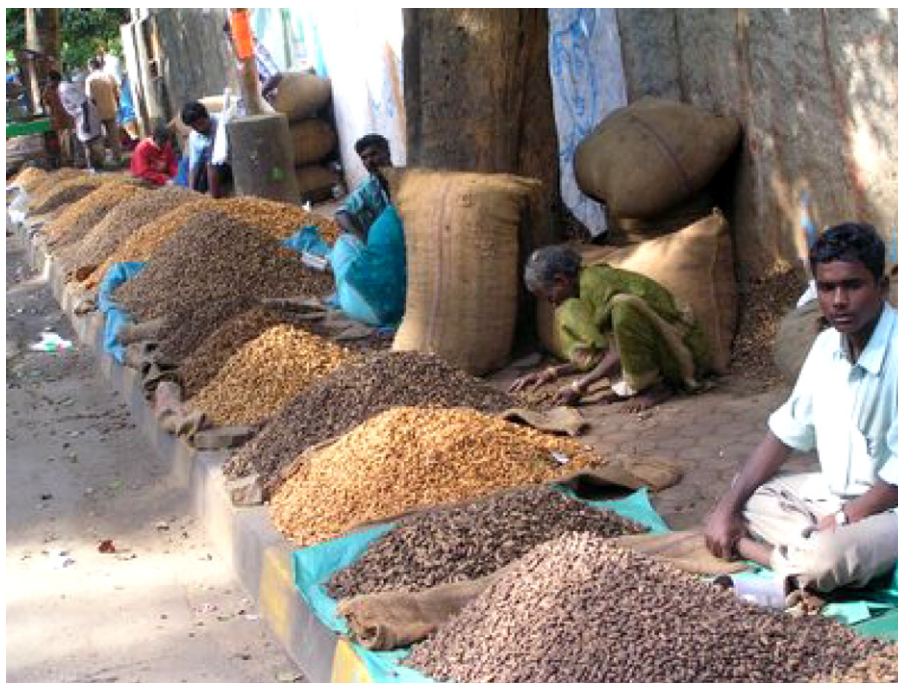
Figure 3 Groundnut Fair – an annual event, colloquially called “Kadelekai Parishe”, has helped Bangalore retain its cultural flavour.

by Cholas, Basavanagudi (Bull Temple) built by Kempe Gowda during 16th century, Kaadu Malleshwara temple built during 17th century in Dravidian architecture, and Gavi Gangadhareshwara temple, all nestle in the middle of the city. Apart from the numerous temples that have mushroomed around the city, Bangalore also has one of the six basilicas in the country, built during the 17th century, St. Marks Cathedral built during 1808, the oldest mosque, Sang-een Jamia Masjid built by the Moghuls during the 17th century, and the popular Jamia Masjid near the City Market built during the 1940s. The ‘Bengalooru Karaga’ is a major annual fair associated with the Dharamaraya temple, is considered to be the actual fair of the erstwhile city, and is still persistent in the older central parts of the city. Karaga, a five-day festival of Tigalas, a community who migrated from Tamil Nadu, has many unique features such as intense religious fervour, strict rituals, unchanged traditions over centuries, a fixed route and stops for the procession, welcome and respect shown at all the temples on route. The annual groundnut fair, ‘Kadelekai Parishe’ takes place in a