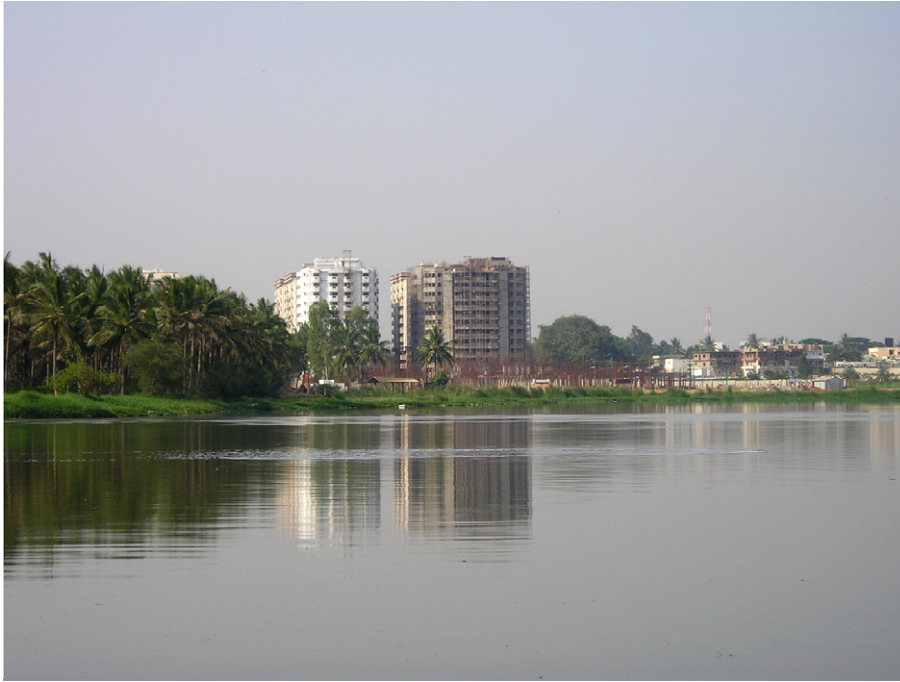
Figure 4 Bangalore, once boasted of 81 lakes in the city limits, while now about 33 show some signs of existence. High-rise buildings sprouting across Bellandur lake.

while another 15 show only faint signs of their former existence. With the city's unprecedented growth, the large number of public open spaces diminished over the years. Much of the loss in green cover is due to the rapid change in land use. As the city grew over space and time, inner areas got more crowded and congested. Initiatives to ease congestion on road networks have led to axing numerous road-side trees. Many lakes have been converted into residential layouts, bus stands, play grounds and stadiums, etc. (Figure 4). The built-up area in the metropolitan area was 16% of total in 2000 and is currently estimated to be around 23–24%. The rest of the area is occupied by either agriculture lands, quarries or other vacant land.