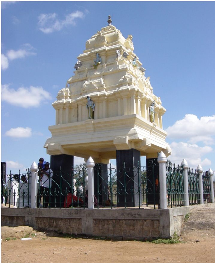
Figure 2 The Kempe Gowda Tower at Lalbagh – one of the four towers Kempe Gowda built to demarcate the extent of city growth in four directions.

to the king. Pleased with her hospitality, the king named the place as ' benda kaala ooruu ' (town of boiled beans). But it is interesting to note that there was already evidence for name of the place much before Hoysalas. Kamath (1990) notes that Bangalore is said to have got its name from benga , the local Kannada language term for Pterocarpus marsupium , a species of dry and moist deciduous tree, and ooru , meaning town. However, the founding of modern Bangalore is attributed to Kempe Gowda, a scion of the Yelahanka line of chiefs, in 1537 (Kamath, 1990). Kempe Gowda is also credited with construction of four towers along four directions from Petta , the central part of the city, to demarcate the extent of city growth (Figure 2). By the 1960s the city had sprawled beyond these boundaries (Asian Development Bank, 2001).