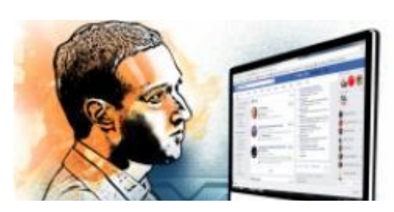
FB's fact-checking initiative in state 14 hrs ago