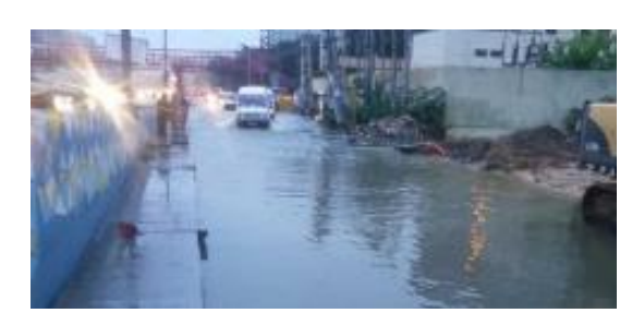
Stay cool: Water-borne diseases unlikely to ruin summer fun 14 hrs ago