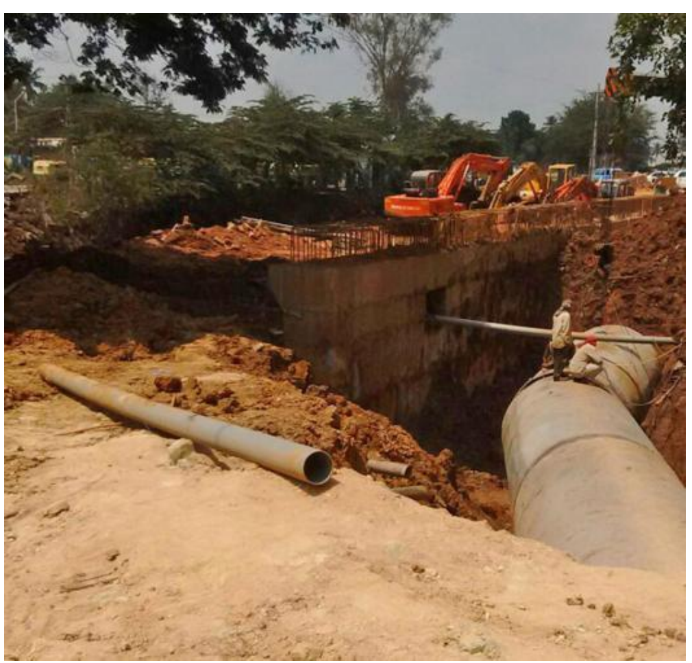
The pipeline being laid in the Varthur lakebed to pump treated water to Kolar.

DH News Service, CREATED: APR 16 2018, 00:57AM IST | UPDATED: APR 16 2018, 08:08AM IST