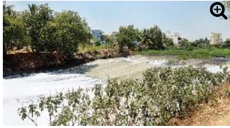
BBMP has warned of action against those dumping garbage in Bellandur Lake | Pushkar V

BENGALURU: Despite the National Green Tribunal order fixing a penalty of Rs 5 lakh for dumping in Bellandur Lake, there seem to be no deterrence among contractors.