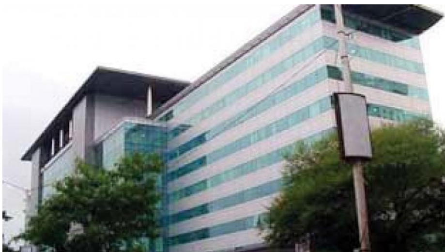
For representation only

Greater Bengaluru with its many Information Technology industries is ranked fifth in emission of greenhouse gases.