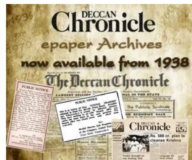
( http://epaperarchives.deccanchronicle.com/ )

Bengaluru: A fast developing city, Bengaluru is in no way helping the country, which is a signatory to the ambitious Paris agreement of 2015, achieve its goal of de-carbonisation. Going by the Indian Institute of Science (IISc.), the city's many high-rise buildings with glass facades consume 10 times more electricity