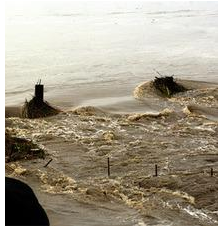
As the police the boat was found, which could be one of the reasons for the tragedy.

PTI | Updated: Sep 14, 2017, 12:23 PM IST