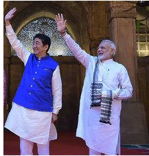
Leaders will have bilateral talks at Mahatma Mandir, a convention centre designed around Gandhian philosophy.