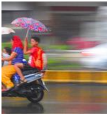
ish, Haryana and Madhya e the hardest hit states, in deficits of 31%, 28% and ctively....