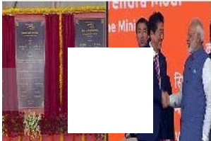
PM Modi and Japanese PM Shinzo Abe lay foundation stone of India's first bullet train

ECONOMICTIMES.COM | Updated: Sep 14, 2017, 12:55 PM IST