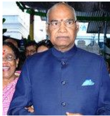
ent's secretariat was impeded when First Lady Kovind wanted to write a letter to the wives' welfare association of a paramilitary force....