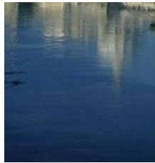
Low on water, Chikkaballapur districts produce 11 lakh litres of milk a day and are home to the second largest milk union in Karnataka.

ET Bureau | Updated: Sep 14, 2017, 11.16 AM IST