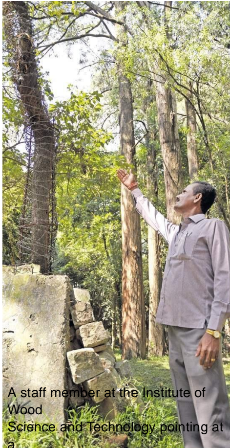
A staff member at the Institute of Wood Science and Technology pointing at a

BENGALURU: The city has many patches of forested lands and in them are valuable sandalwood. Lalbagh Gardens, Cubbon Park, the Indian Institute of Science and University of Agricultural Sciences (UAS) are some of these places where sandalwood thefts have been reported from.