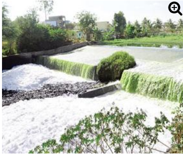
Bellandur lake is one of the most polluted lakes in the city

MOODBIDRI: Bad politics, bad bureaucrats and bad builders have made ruined Bengaluru's water bodies. The Bellandur and Varthur lakes are striking examples of bad management of water bodies," said Union minister for Environment, Ecology and Climate change Anil Madhav Dave here on Friday. Speaking at the conclusion of the three-day International Lake Conference, he said, "I am deeply concerned and disappointed about the way the Nethravati river and the lakes of Bengaluru are being treated. I will spare no efforts to restore these water bodies to their pristine condition. In the coming days you will see there will be marked developments on these two issues," the minister asserted.