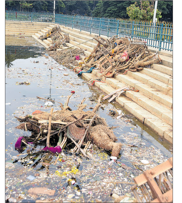
Uncleared remains of immersed Durga idols at Ulsoor lake on Thursday.