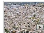
Ulsoor lake: Thousands of fish found dead...