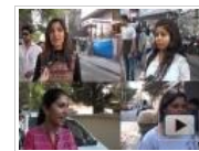
Women's day special: Safety first