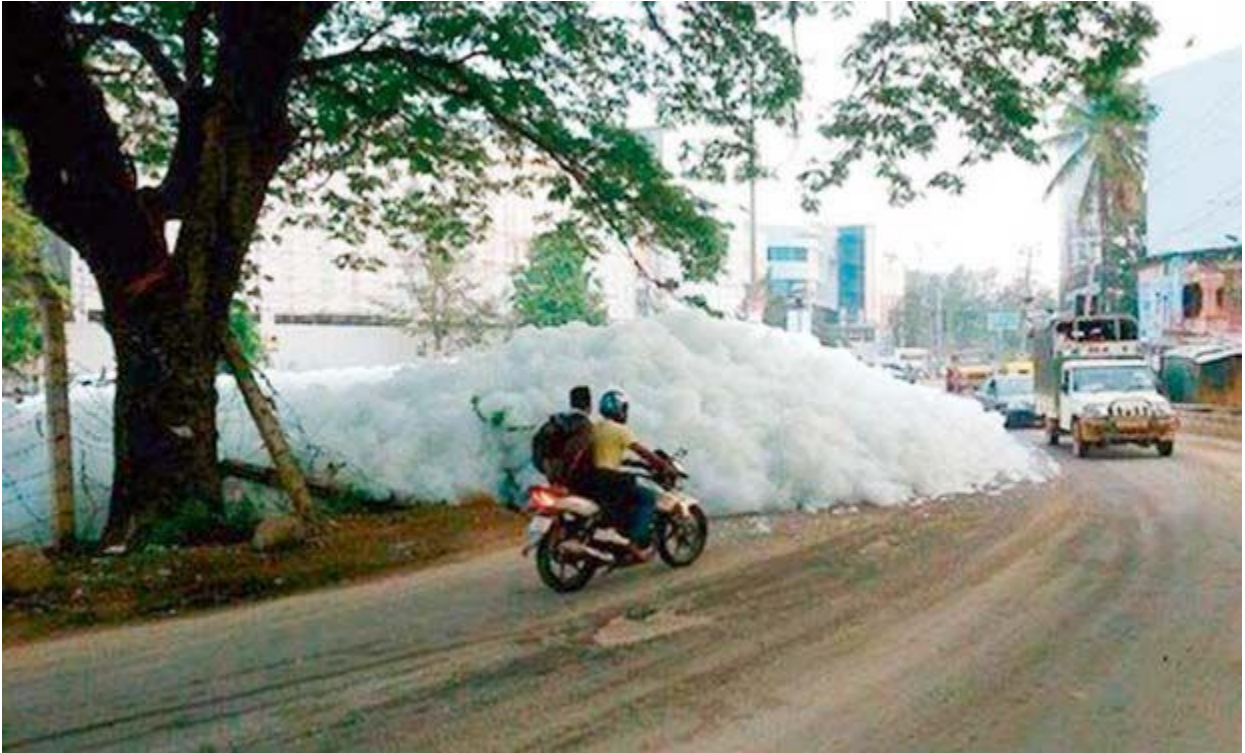
Foam coming out of Varthur lake

DC CORRESPONDENT | June 06, 2015, 01.06 am IST