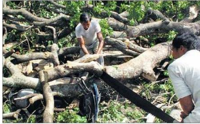
Bangalore has a total of 14,78,412 trees or just one tree for six of its citizens, the same as in Mumbai.

To sum it up, Bangalore has a total of 14,78,412 trees while Nagpur has 21,43,838, Mumbai 19,17,844 and Navi Mumbai 4,78,120. The spatial extent of vegetation in areas such as Chickpet and Shivajinagar is less than a hectare while Varthur, Bellandur and Agara have high vegetation.