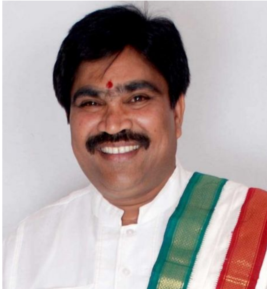
Forest Minister R Shankar

The Karnataka government is mulling a law that mandates growing a minimum of 20 trees on every