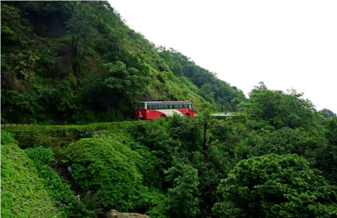
PICTURESQUE: A view of Charmadi Ghats in the Western Ghats range in Karnataka.

Noting that the ecology of the Western Ghats was under serious stress, the National Green Tribunal (NGT) restrained six states falling in the region from giving environmental clearance to activities which may adversely affect the eco-sensitive areas.