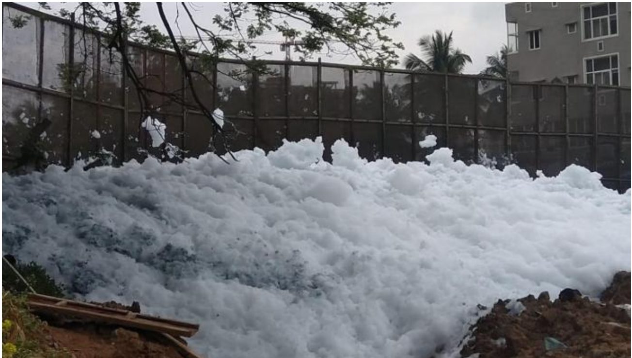
Accumulated foam at the Bellandur Lake weir on Wednesday.