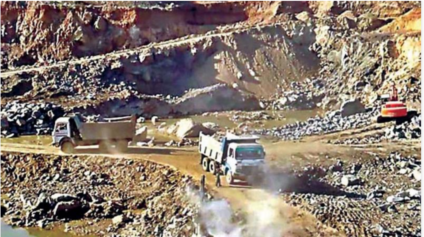
📷 A file photo of the mining activity around Bannerghatta National Park

Though the forest department in March denied about the rampant violations committed by the quarry owners in the eco-sensitive zone (ESZ) of the Bannerghatta National Park, a response to Right to Information (RTI) has revealed widespread violations.